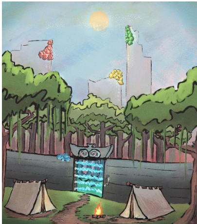
Concept art of the starting village

The art style of Crystal Sin is a cell shaded 3D. This style will perfectly fit the fantasy – like world, we aim to create. Productions that came out not only in recent years, but also over a decade ago prove, that this is a good stylistic choice, looking fresh and colourful, even years after the release.