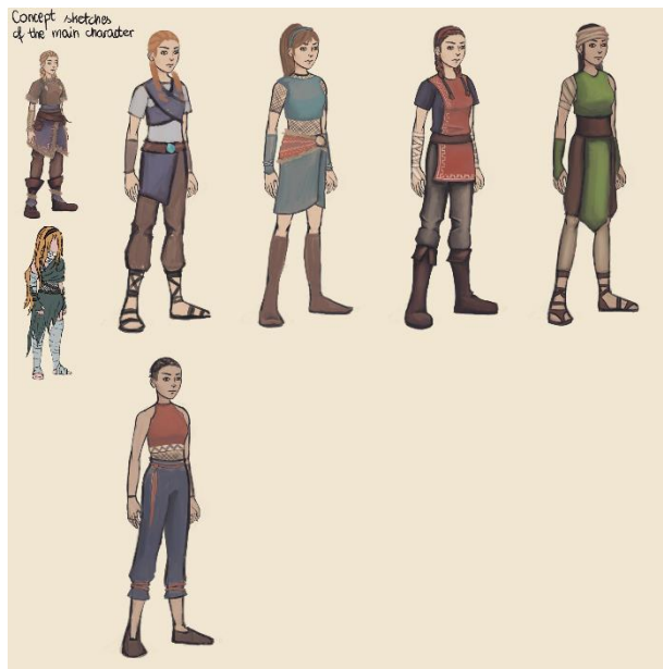
Sketches of the player character

Player character was agreed to be a woman, but still while designing what was needed to be kept in mind was that she still fights using sword – so the decision was made for her to have tied hair, and mostly simple clothing in which it is easy to move around.