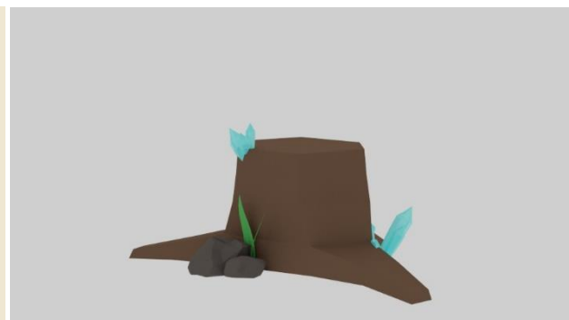
Simple model of the tree trunk