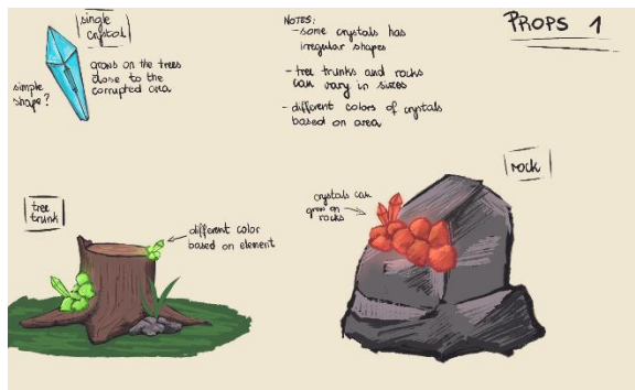
Concept sketch of some props

Most of the props will not require as high level of details as the characters, so most of them will be created only using Maya 2022, skipping the sculpting part. The ones that will need extra details to be added, will follow the workflow set on characters.