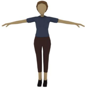
Base model of the character

The sculpted model will be later brought back into Maya for retopology.